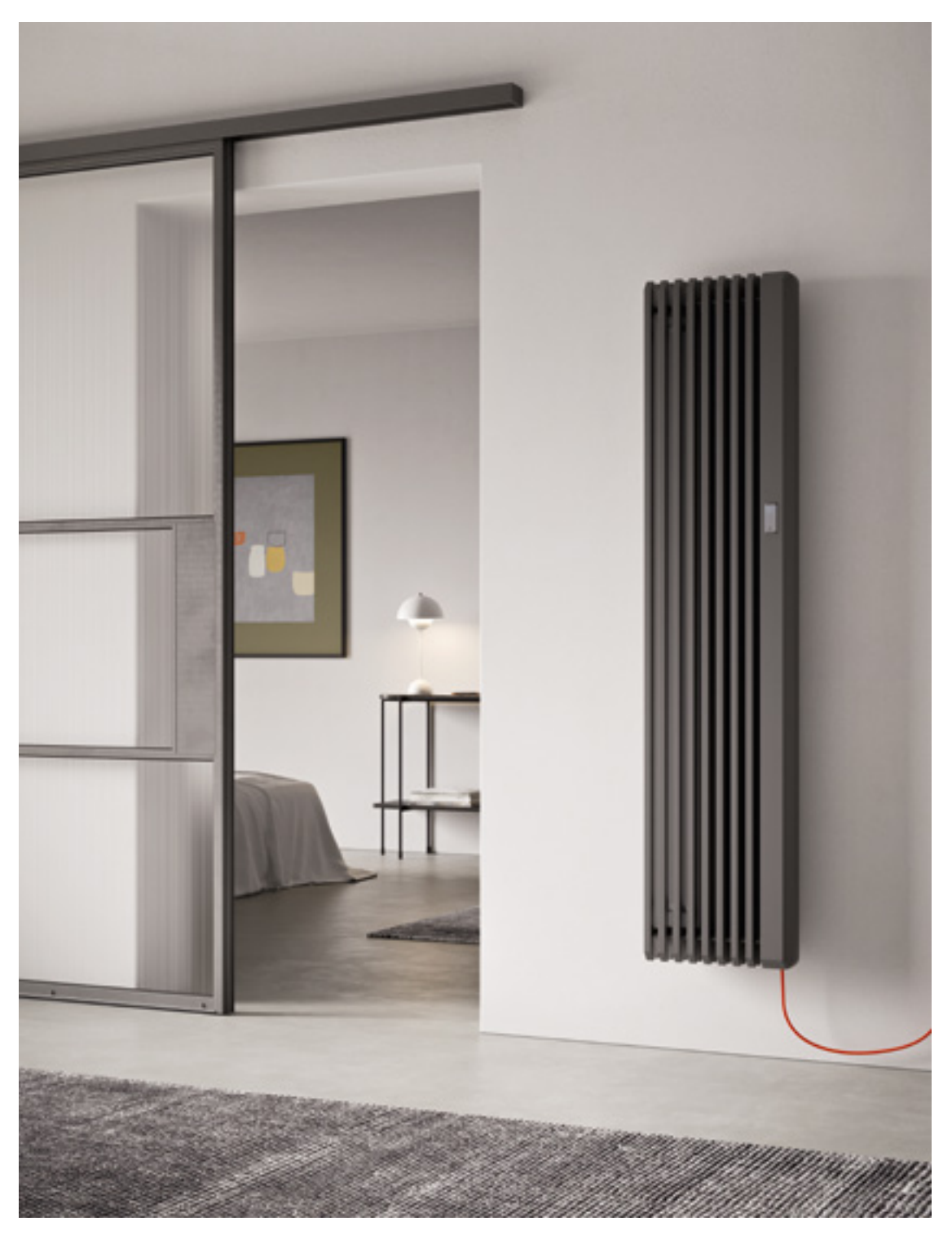
SAX ELECTRIC height 1800 mm, lenght 415 mm. Satin Black finish (cod. 30). Designed by Synthesis Design