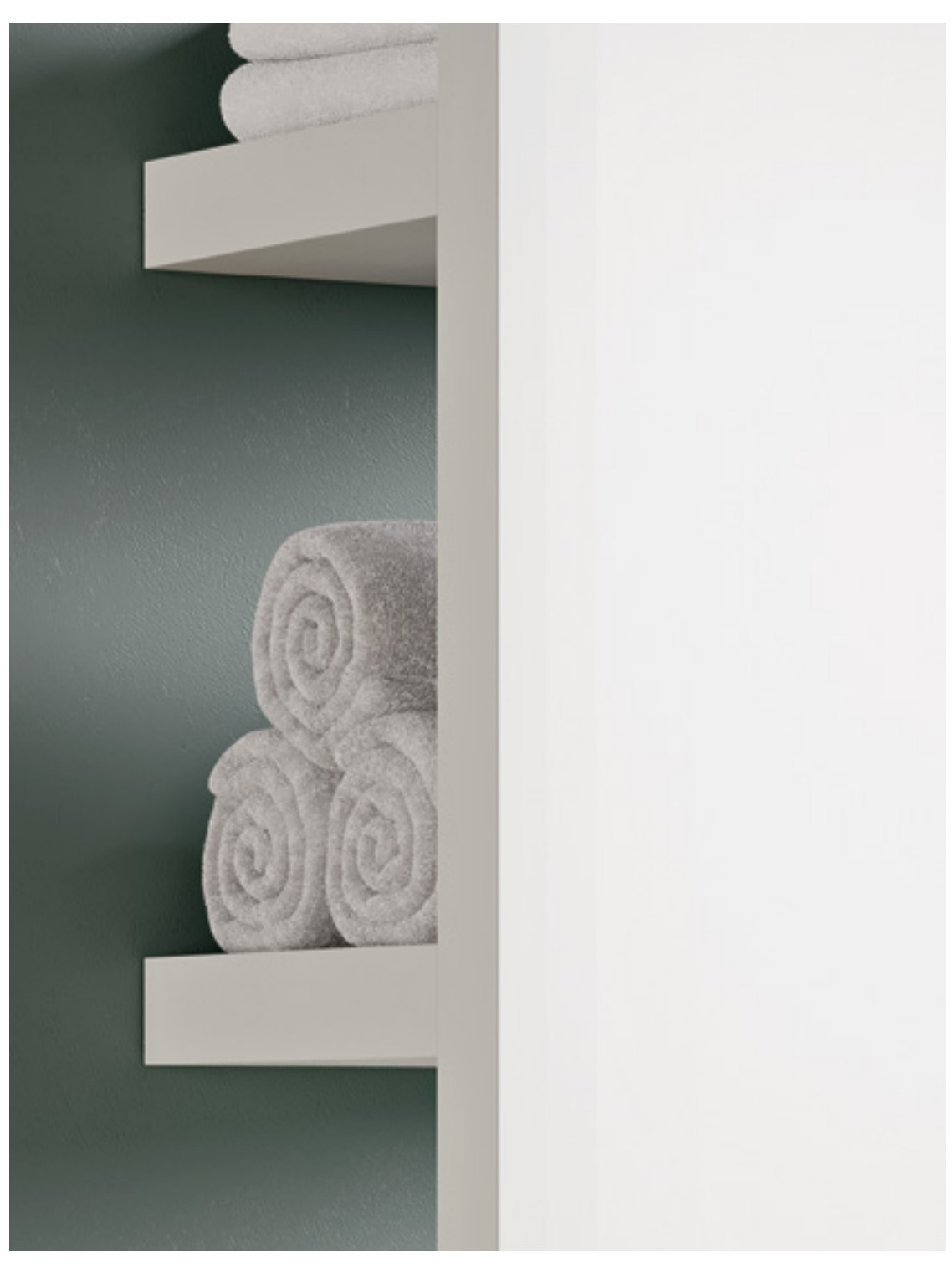
QUADRAQUA ELECTRIC height 1828 mm, lenght 300 mm. Standard White finish (cod. 01). Designed by Domenico De Palo